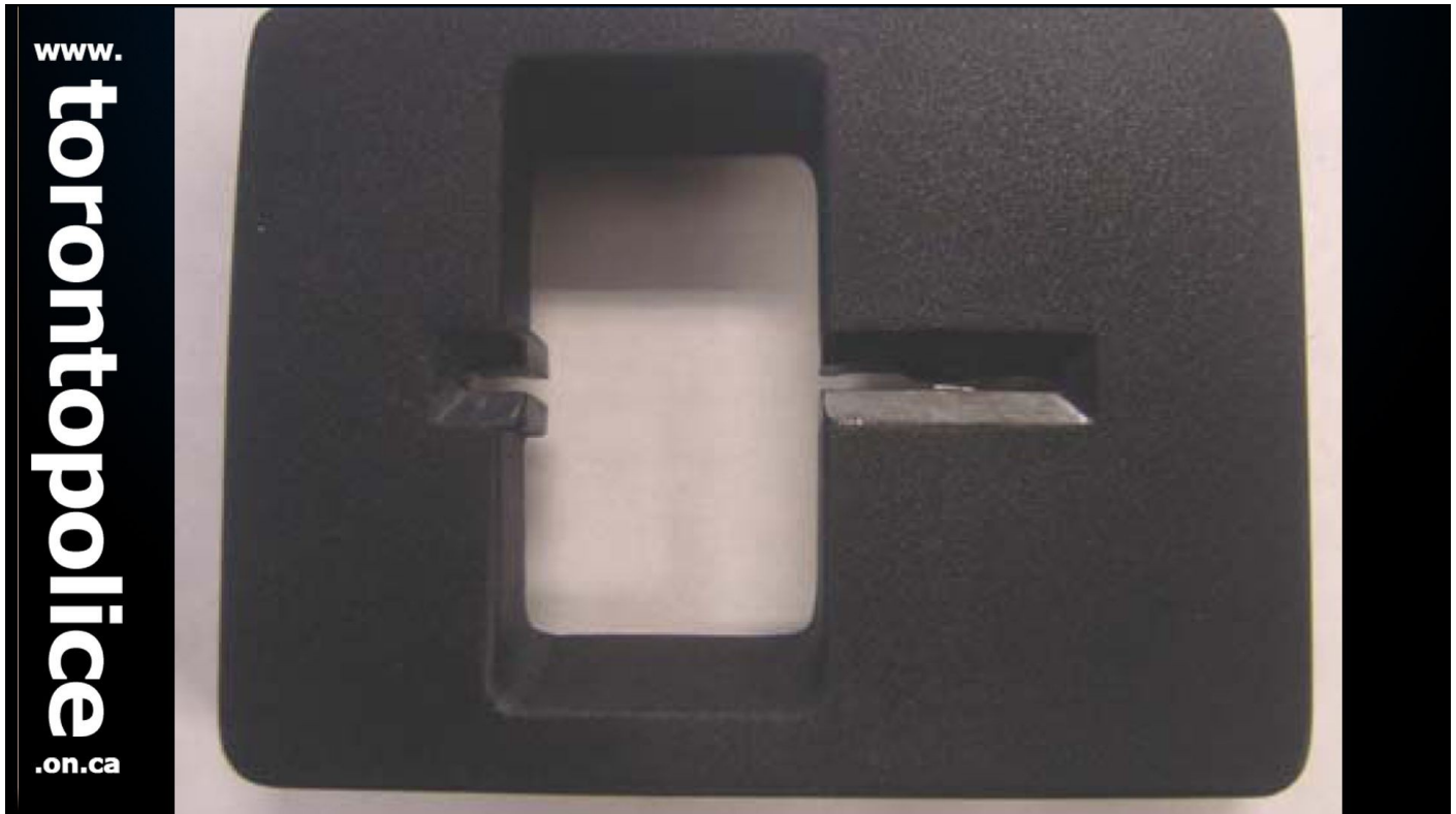
Above: ATM skimming device