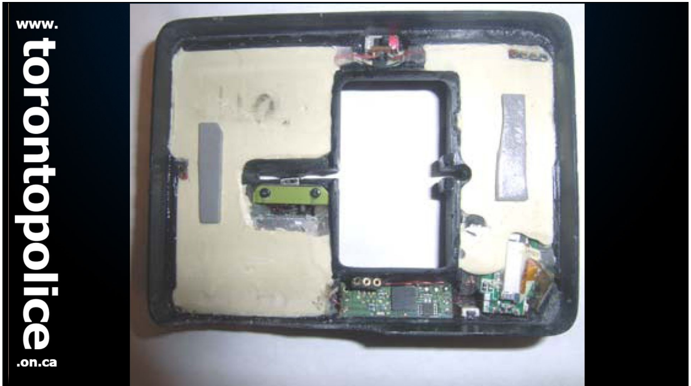
Above: ATM skimming device