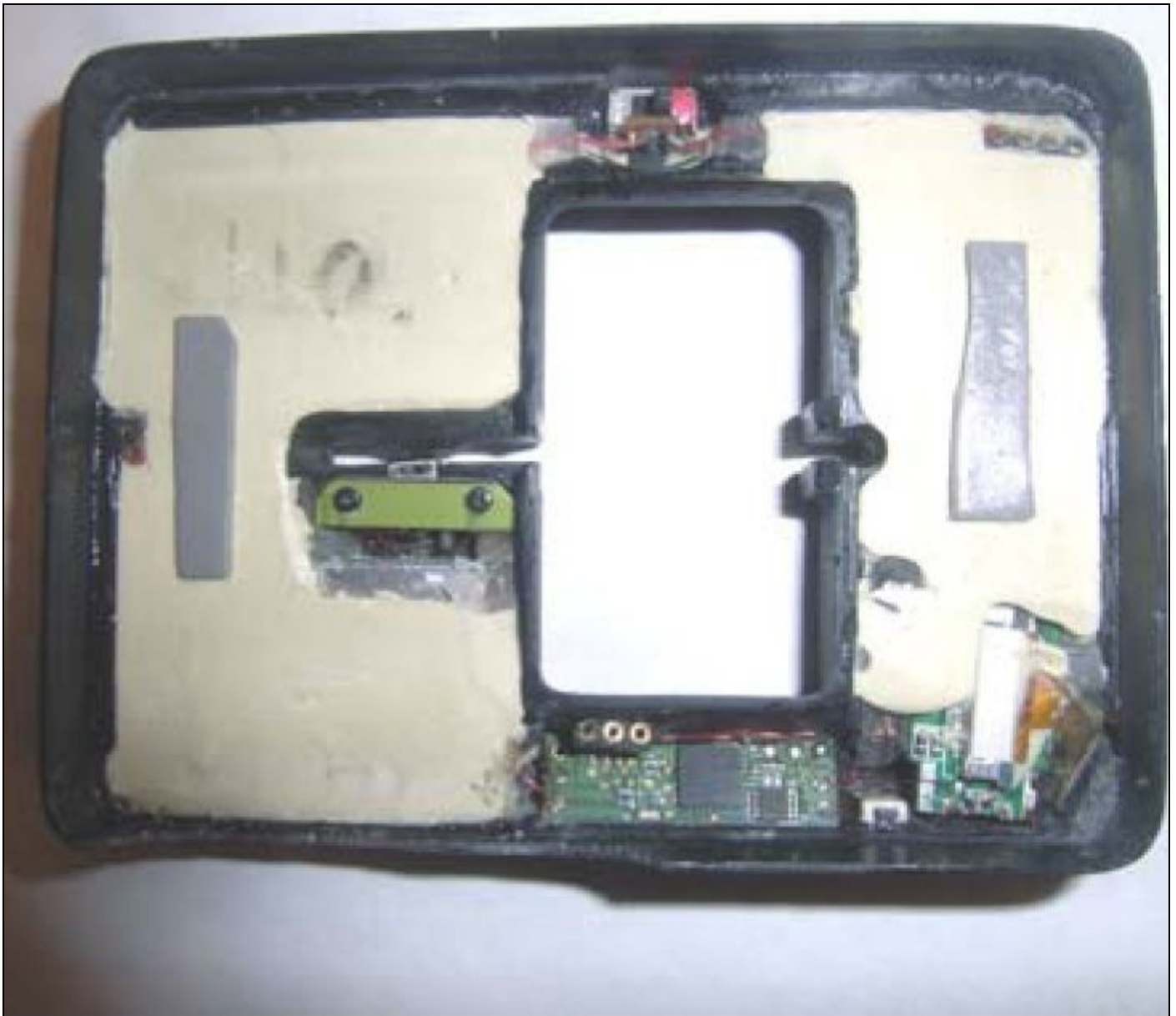
Above: ATM skimming device